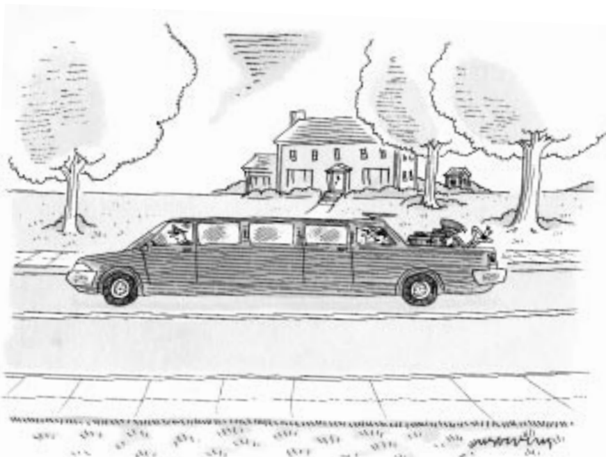
"Lawn care has been good to us, Ed."

But sometimes, just when the brain is about to give up, an insight appears.